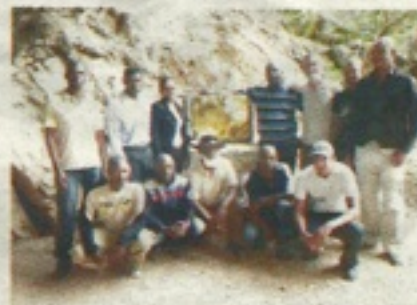
Photo souvenir de ceux qui ont réhabilité la Grande-Caverne.